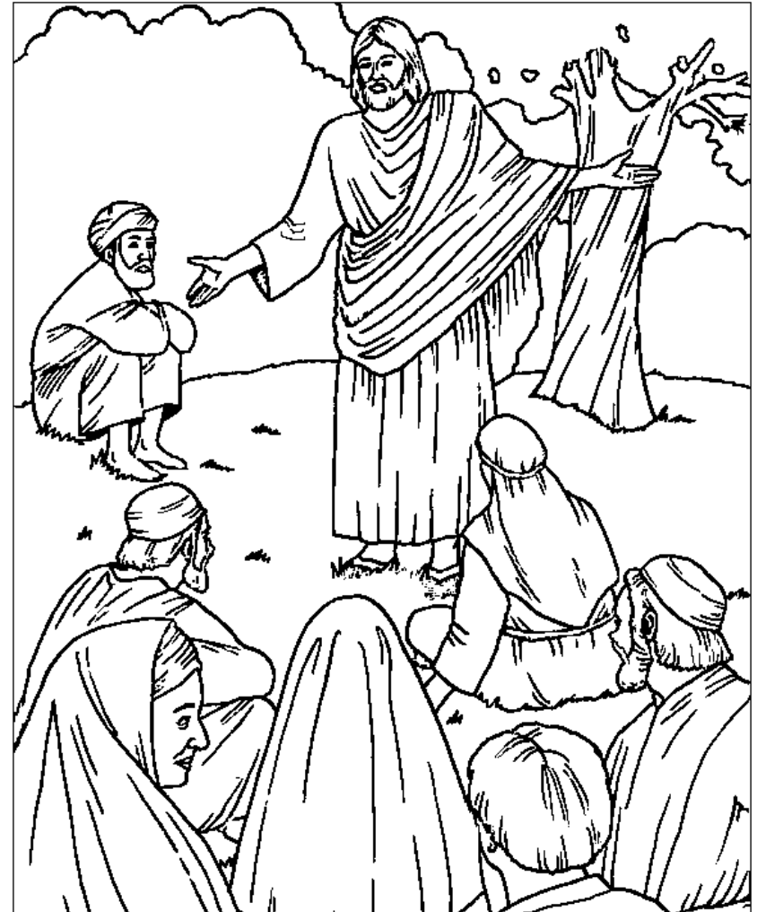
The Sermon on the Mount Matthew 5:1-12